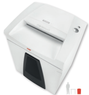
13 HSM SECURIO B35