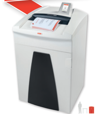
14 15 16 HSM SECURIO P36i / P40i / P44i