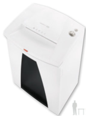
12 HSM SECURIO B34