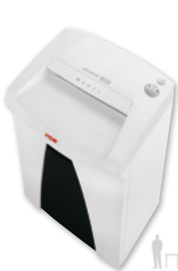
8 9 HSM SECURIO B22 / B24