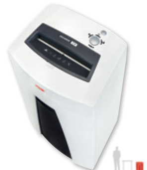
7 HSM SECURIO C18