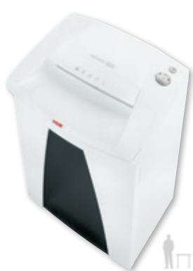
10 11 HSM SECURIO B26 / B32