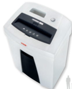
6 HSM SECURIO C16