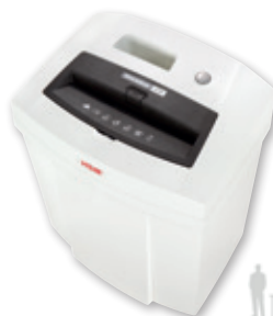
5 HSM SECURIO C14