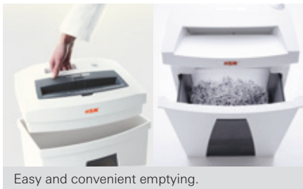
Easy and convenient emptying.