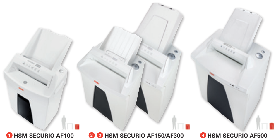
1 HSM SECURIO AF100

Hinged magazine for paper stacks, HSM SECURIO AF300 and AF500.